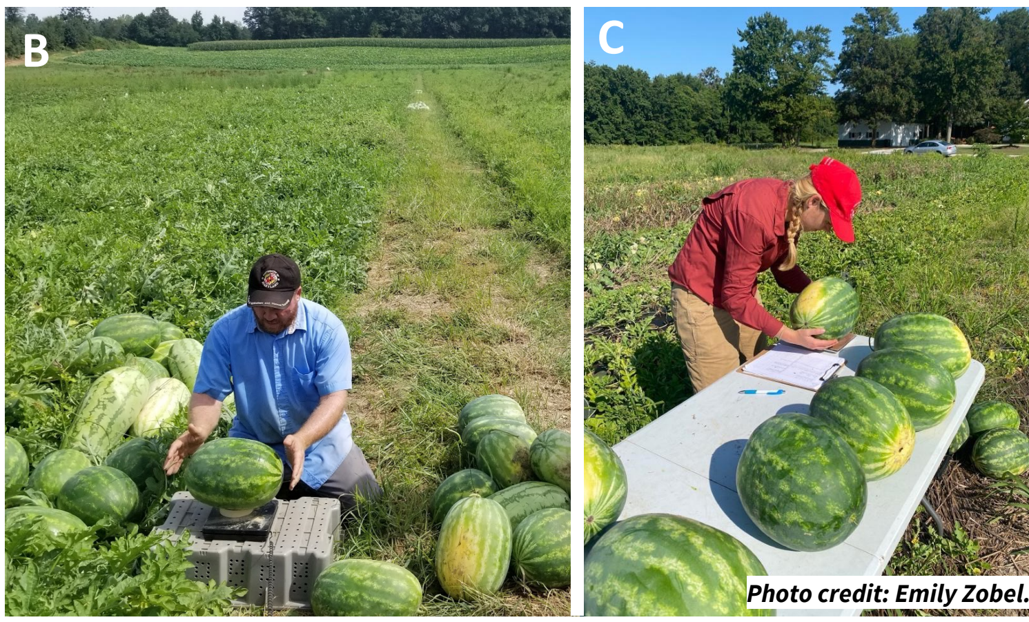
Fig. 4) counting and weighing melons in the field. A) Field sampling area B) At the St. Mary's County site C) At the Wicomico County Site.