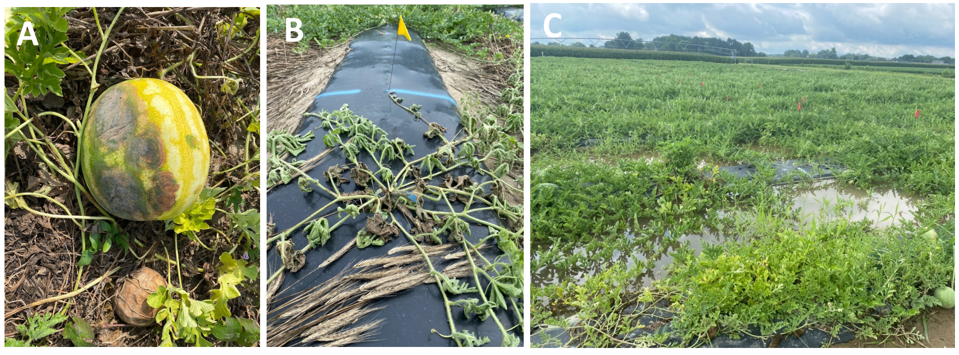
Fig. 8) A) Phytophthora infection of fruit. B) Fusarium crown rot infection in the field. C) Standing water in between watermelon rows caused by a heavy rain event that allowed fungal pathogens to move through the field.