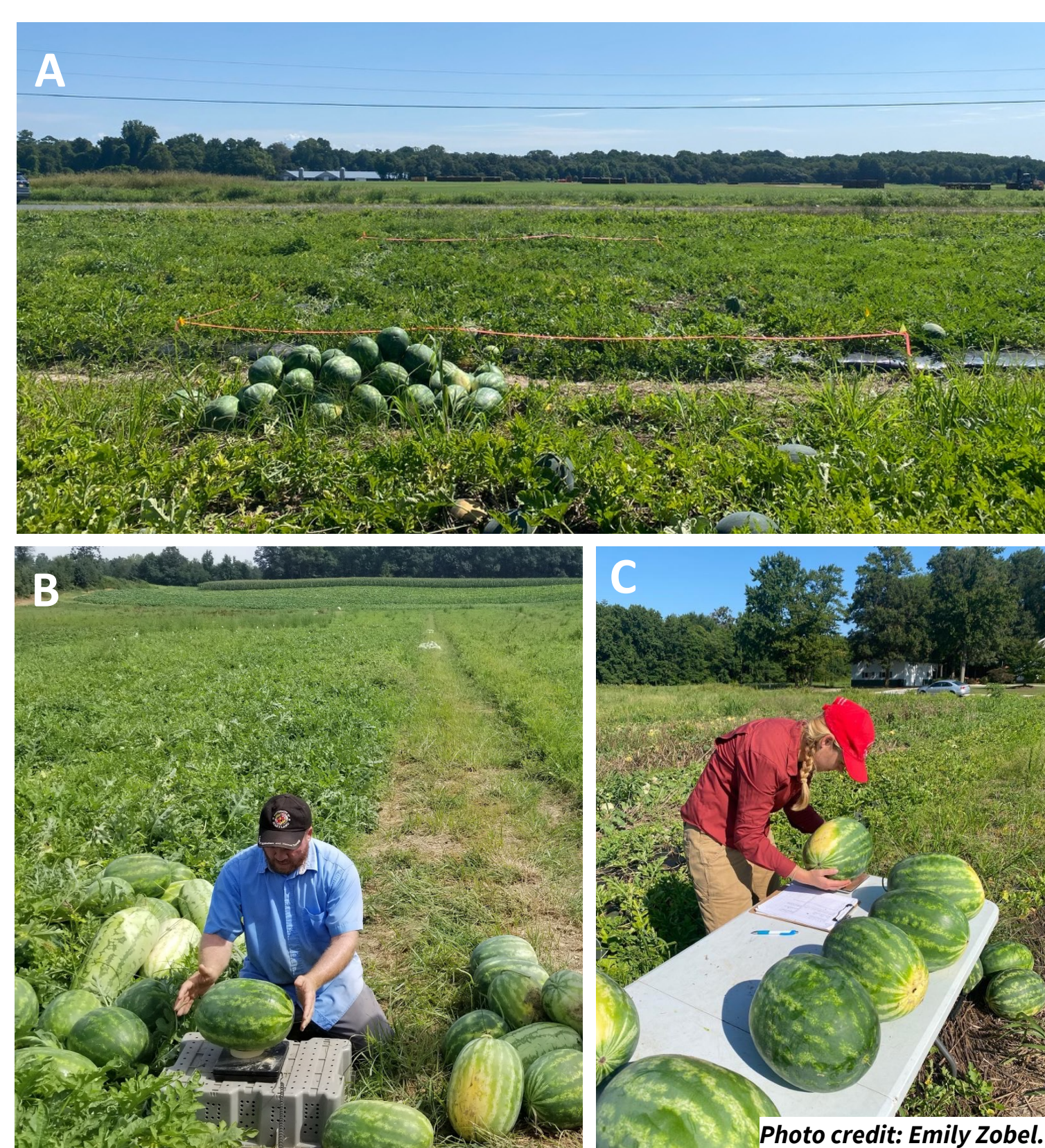
Fig. 4) counting and weighing melons in the field. A) Field sampling area B) At the St. Mary's County site C) At the Wicomico County Site.