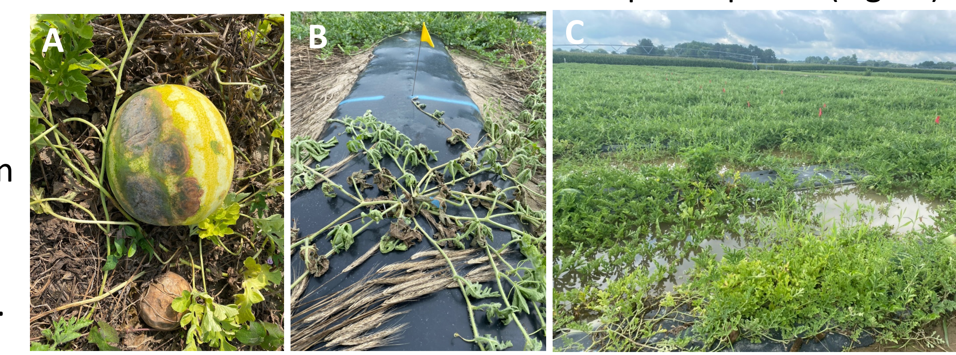
Fig. 8) A) Phytophthora infection of fruit. B) Fusarium crown rot infection in the field. C) Standing water in between watermelon rows caused by a heavy rain event that allowed fungal pathogens to move through the field.