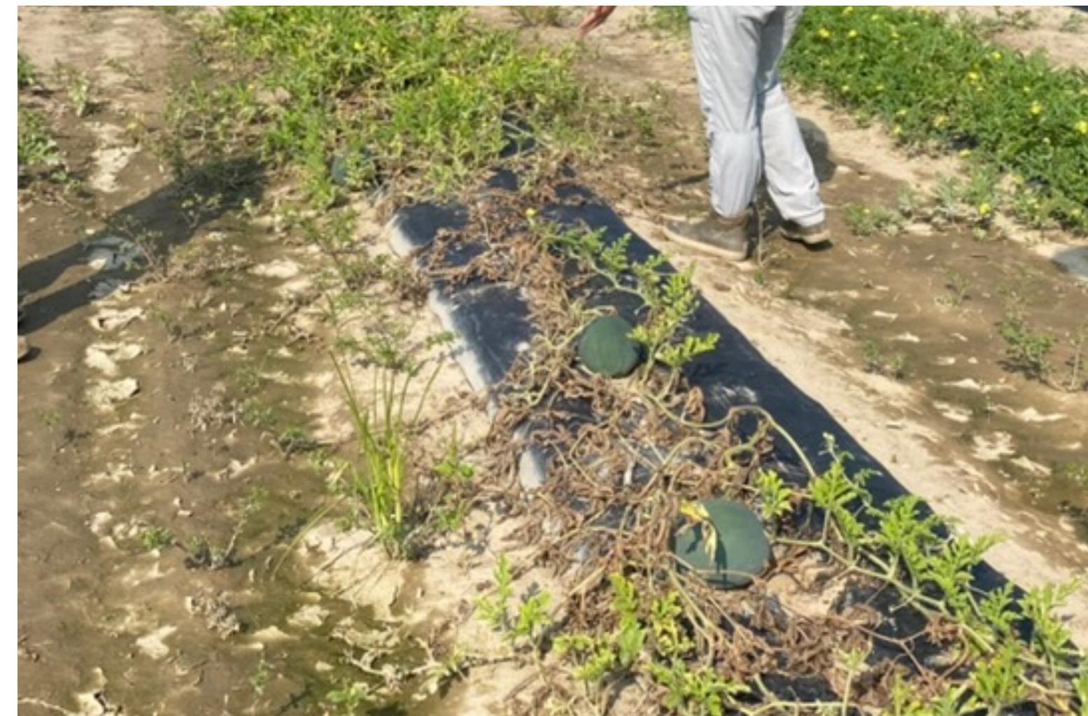
Fig. 1) Depicts Fusarium wilt affecting a watermelon vine. The disease blocks the vascular tissue which lead to total plant collapse.