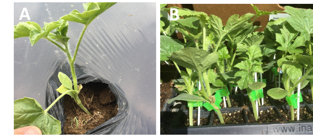
Fig. 2) Grafted watermelon seedlings A) Shows the graft union unclipped and fully healed. B) Tray of grafted plants obtained from Tri-Hishtil. The scion was Facination and the rootstock was Carolina Stongback.