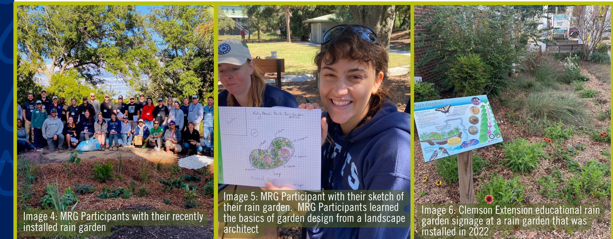
Image 4: MRG Participants with their recently installed rain garden