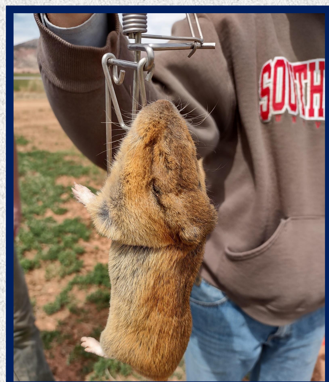
Gopher caught using Gophinator trap