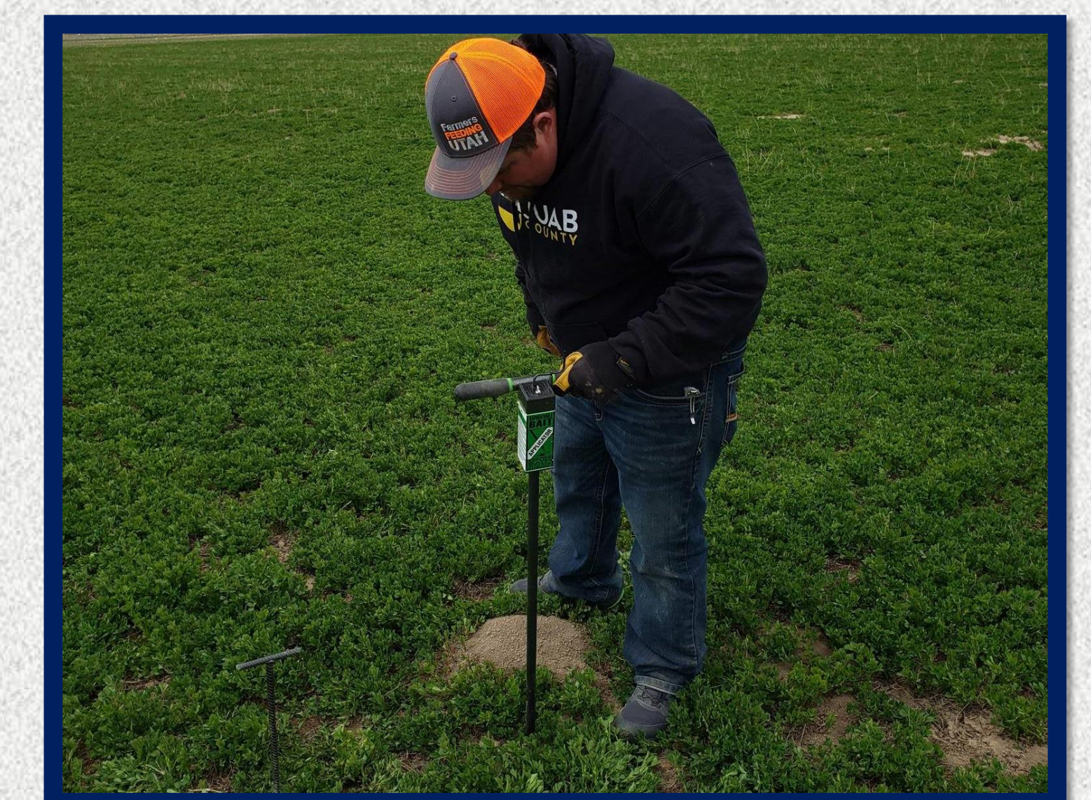
Treating plots with strychnine gopher bait, using bait applicator probe