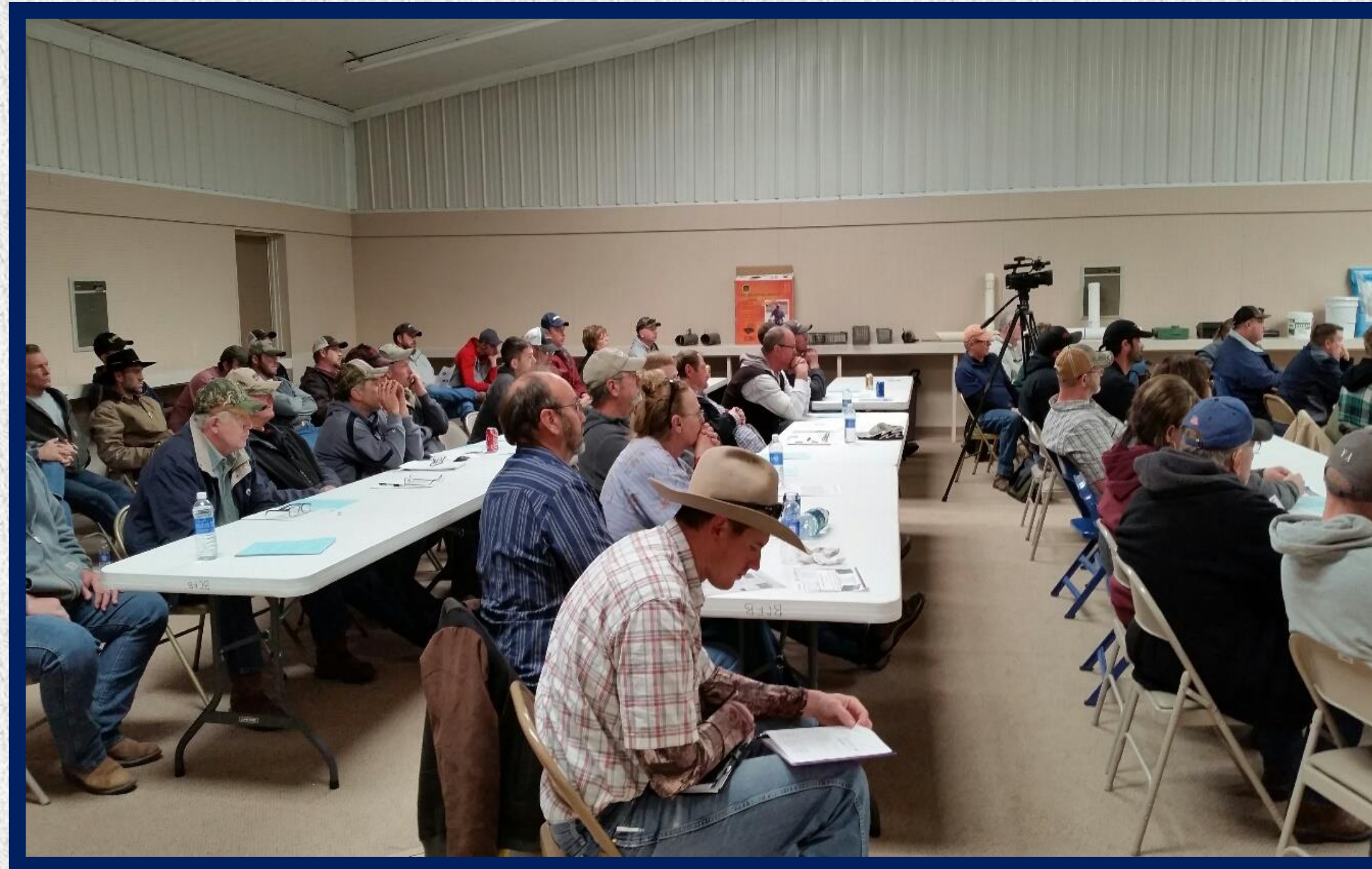
Presenting gopher control information at annual crop school