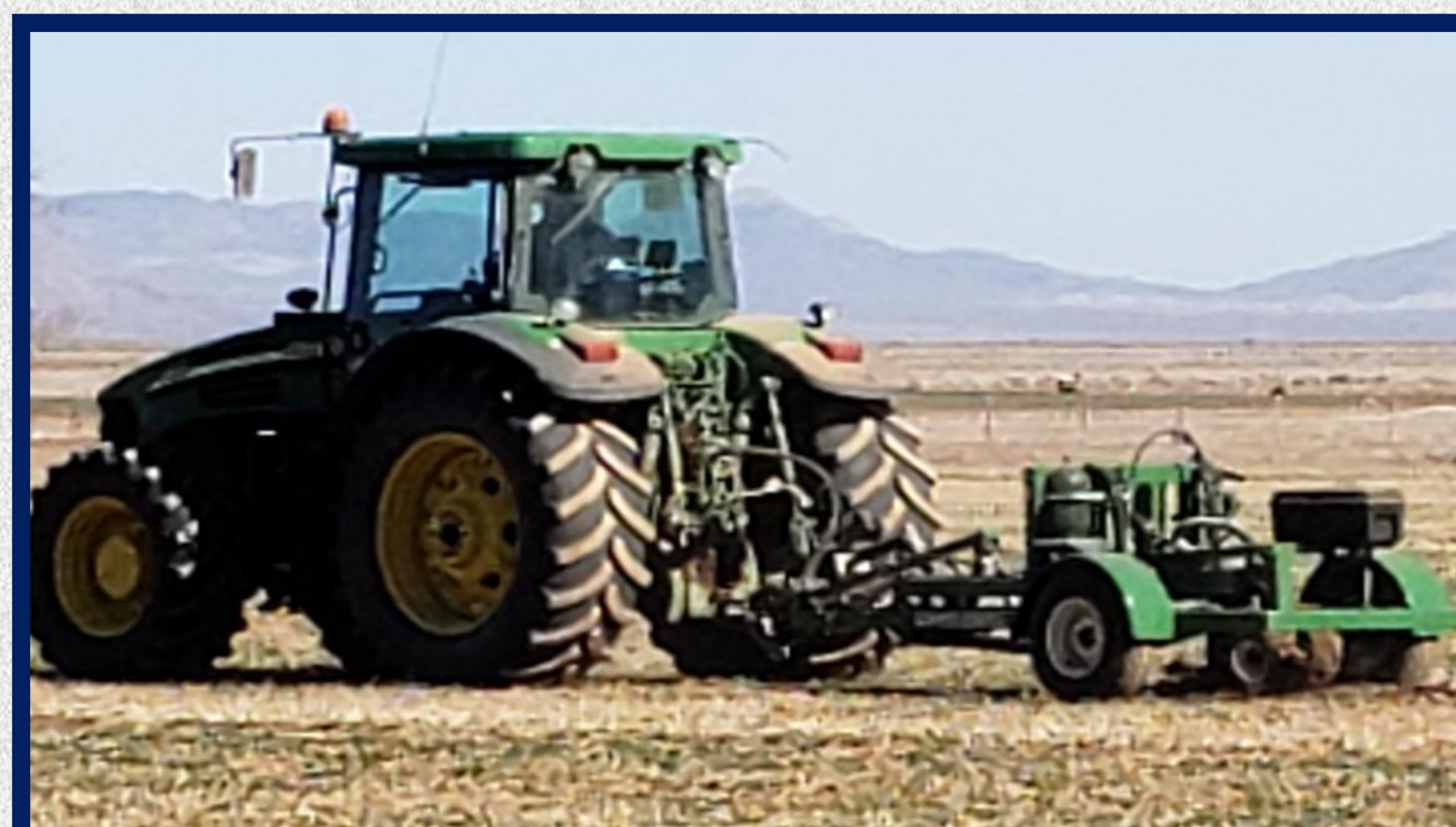
Applying aluminum phosphide using gopher general