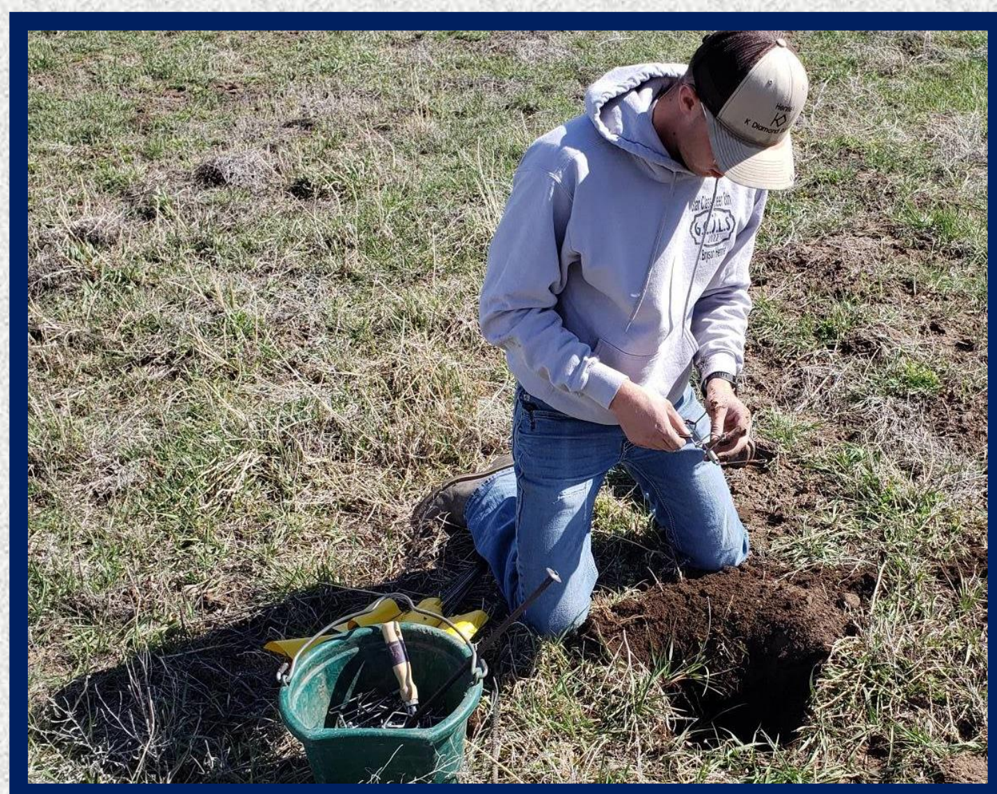
Setting Gophinator traps

Pocket gophers are a common agricultural pest in many areas of Utah, Nevada, and other western states. Pocket gophers are burrowing rodents that leave soil mounds on the surface of the ground. They are called pocket gophers because they have external fur-lined pouches that they use to carry food. Unlike other rodents, pocket gophers are active year-round. They cost farmers hundreds of thousands of dollars annually in control costs, damage to haying equipment and loss of crops. Several new methods of controlling pocket gophers have been recently introduced in Utah but very little research has been done to determine how effective these new methods are.