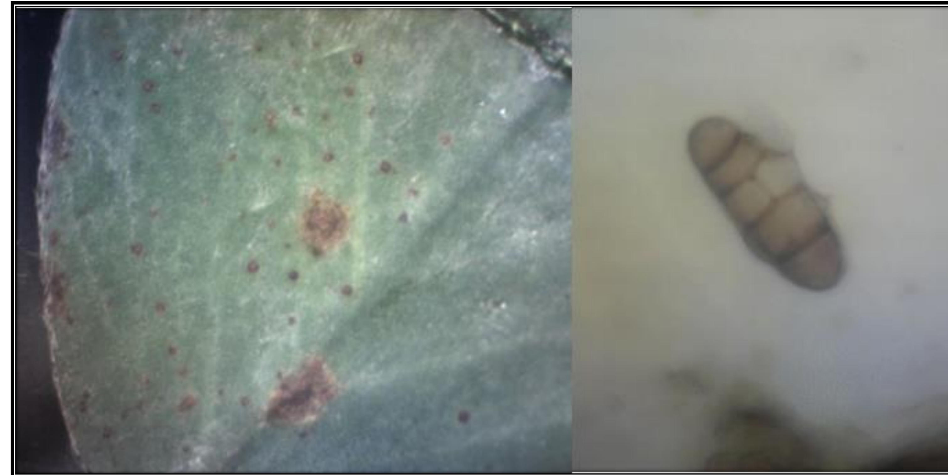
Leptosphaerulina leaf spot ( Leptosphaerulina briosiana )

Plants were monitored for any disease presence, but in particular, the plants were monitored for common leaf spot, Verticillium wilt, Sclerotinia crown and stem rot, and stemphylium leaf spot. These diseases are listed as some of the most common diseases that affect alfalfa (Vencelli and Smith, 2014). During observation, plant tissue was collected in order to be viewed microscopically to verify pathogens identified. Collected plant tissue were placed in a wet chamber for 24-48 hours to encourage spore growth. After pathogens were verified in the plant tissue, pathogens were recorded.