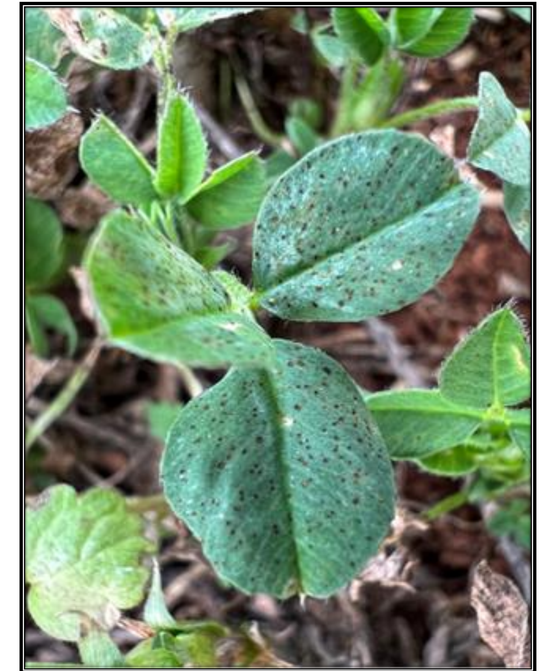
Common leaf spot ( Pseudopeziza medicaginis )