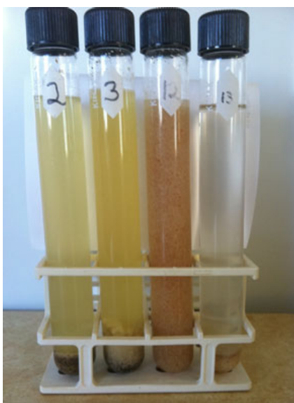
Figure 3. Qualitative analysis of oilseed meals.

Average daily gain is also influenced by supplement (Figure 2). Consistent with BW changes, feeding canola meal resulted in higher ADG when compared to camelina meal and control diets ( P<0.01 and P<0.05 , respectively). No significant differences ( P=0.16 ) in ADG were observed between canola meal and soybean meal. The percentage change in cumulative BW among the treatments was in agreement with the percentage change for ADG. Therefore, BW change translated into higher gains.