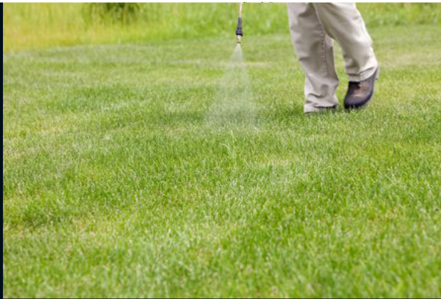
Commercial Pesticide Application