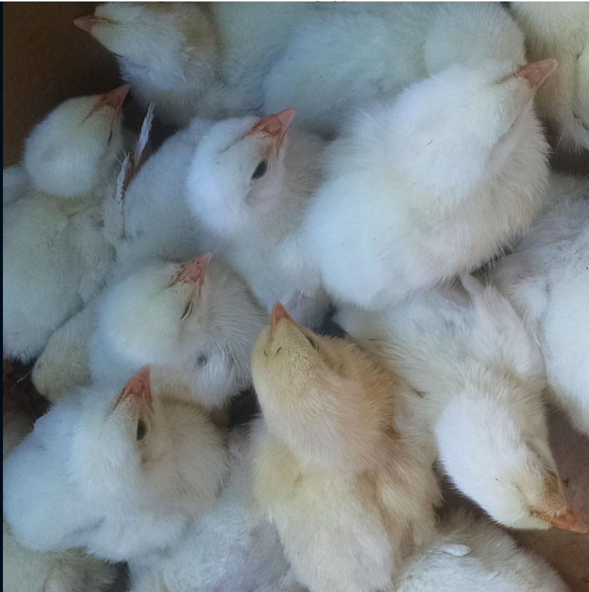
Chicks. Chicks & More Chicks!

May saw the final rounds of the Embryology Project. The culmination of this project saw some of the greatest hatch rates. Overall this unit study is an incredible opportunity for 2nd grade students throughout Union County to learn about the development from egg to chicks.