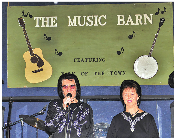
Young Spirit was one of many groups who performed at the Williamson Music Barn's annual barbecue fundraiser March 30. The venue welcomes visitors for free shows each Friday.

Barn is a non-profit organization that provides free live music in a family-friendly atmosphere. The annual fundraiser brings in funds for necessary repairs and to help keep the place open. The venue gives local and surrounding area bands a place to play and great entertainment