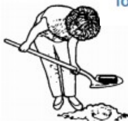
Figure 2. If you don't have a soil probe, use a hand trowel, shovel, or other garden tool. Trim out soil of uniform thickness to the recommended depth.