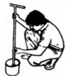
Figure 3. Place 10–15 soil cores into a plastic bucket; mix, dry, and transfer to a bag.