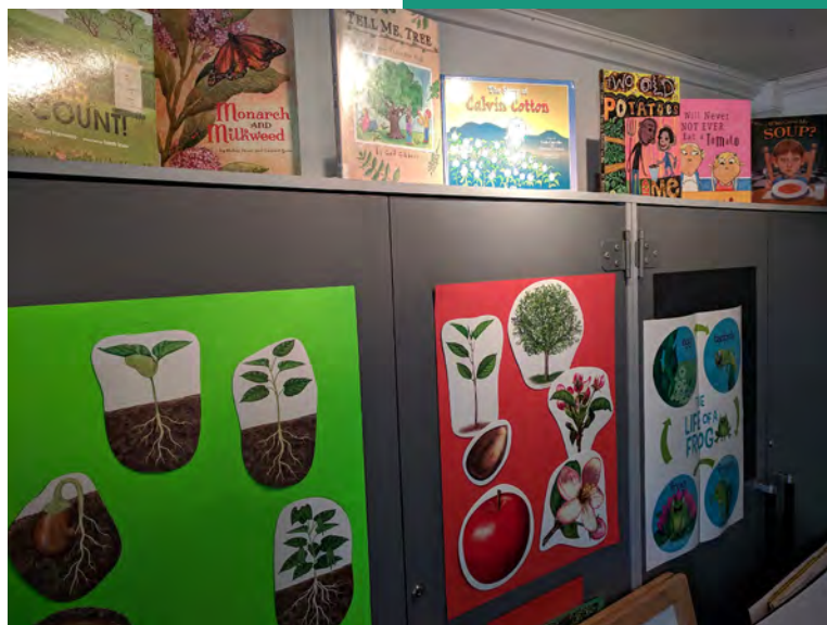
VOLUNTEER MASTER GARDENERS DECORATED NEW CABINETS