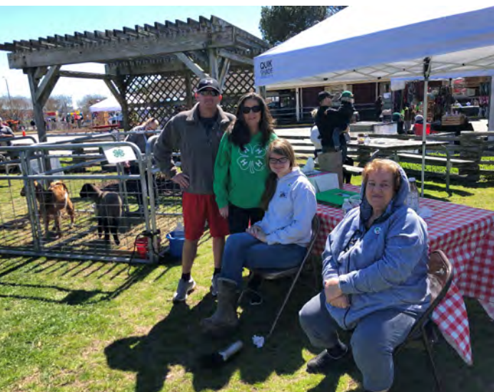
Patrons enjoying the Celebrate Agriculture event held at Farmers Market on March 23, 2019.

Hope to see you at the Farmers Market soon.