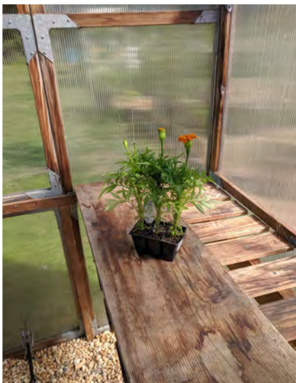
(L) The first plant in the greenhouse