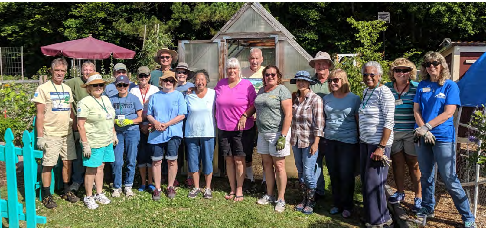
Below: Virginia Beach Master Gardeners at Farmers Market