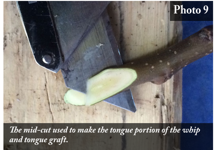
Photo 9 The mid-cut used to make the tongue portion of the whip and tongue graft.

Make a second cut one-third of the way in each piece to form the “tongue” (Photo 9).