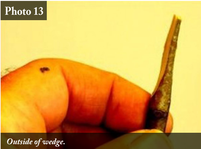
Outside of wedge.