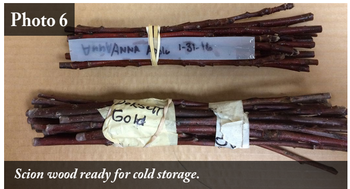
Scion wood ready for cold storage.

To store the scion wood, place each variety in a moist (not saturated) medium, such as sphagnum moss, sawdust, or paper towels, and place in a sealable plastic bag. All bundles should be labeled by cultivar name and date collected. A garbage bag is good for large quantities of scion wood. Do not let the wood dry out. Store the wrapped packages of propagating wood in a refrigerated room at 34–38°F. Properly stored scion wood should remain in good condition until it is ready for use in late winter through early spring.