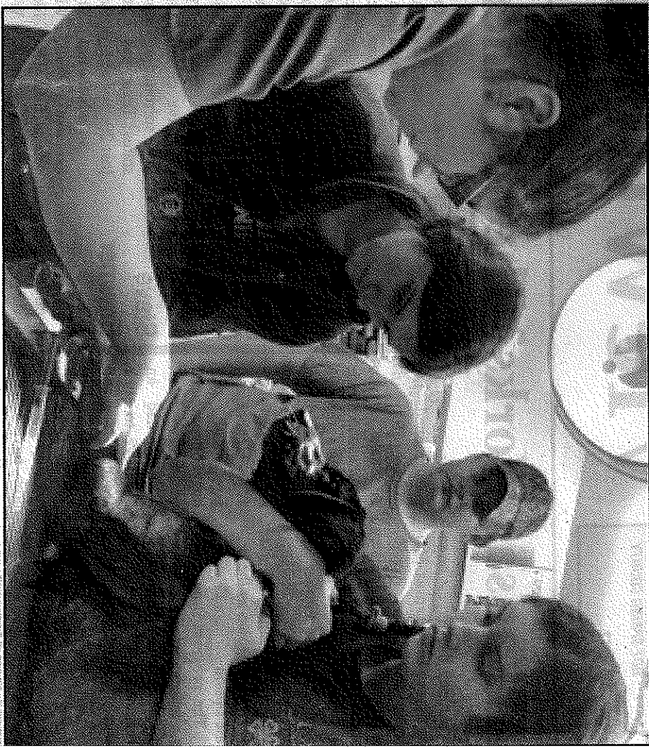
Special to the MDF